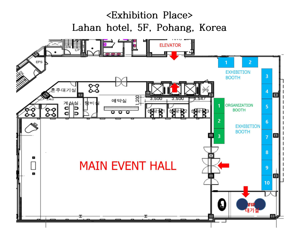
< Exhibit Hours > The exhibition takes place from Wednesday November 13th to Friday November 15th

The industrial exhibition is formulated to provide industries with a valuable opportunity to present their high-end products and to have direct interactions with the community of accelerators and beam utilizations.